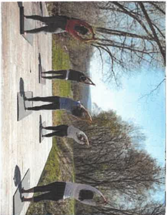
Annual Updates to Assess Progress