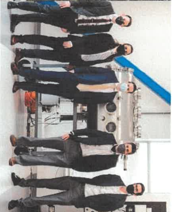
Follow-Up on Priority Projects