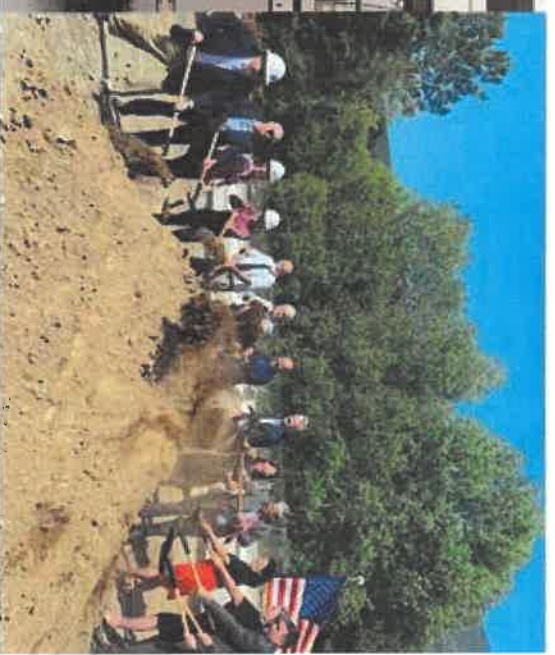
Continued Conversations with Municipal Stakeholders